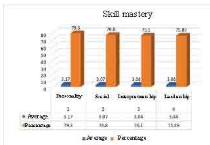
Figure 1. Mastery of Principal Skills