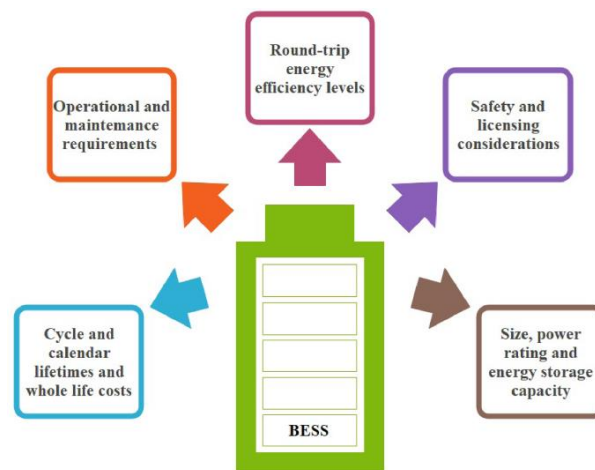
Fig. 2. Performance characteristics of selecting BESS

To respond to electricity demand and minimize environmental problems, RES emerges as an alternative solution. Among those available, wind and solar energies are growing rapidly, particularly in the last few years (Shayan et al., 2023; Pontes et al., 2023; Alsharif et al., 2023). The added value of these RES leads to an increase in investment in some regions of the world, namely in Europe, which increased the share of electricity generation based on RES from 20.1% in 2005 to 34.2% in 2015. In terms of wind power, as an example, in 2019, a total of 60.4 GW was installed, increasing the global total wind power capacity to 651 GW. China and the US were responsible for more than 60% of the onshore wind power additions performed during this year, with Europe being in the lead in terms of offshore wind power, accounting for about 59% of the total offshore additions. In terms of solar photovoltaics (PV), the global capacity additions in 2019 were 114.9 GW, with China being the biggest contributor with 30.1 GW additions during this year, followed by the United States with 13.3 GW, and Japan with 7.7 GW. A total of 629 GW of cumulative solar PV capacity was achieved at the end of 2019 throughout the world (Gade & Agrawan, 2023; Tabak et al., 2022; Alsadi & Nassar, 2017; Ali, 2023; Rahmani et al., 2023; Khaleel, 2023; Wang et al., 2024).