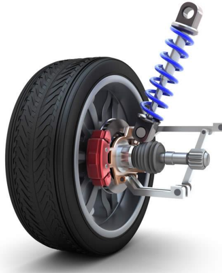
Figure 1. An illustration of a car shock absorber.

the shock absorber is to maintain tire contact with the road surface at all times, resulting in the safest vehicle control and brake reaction. Figure 1 is an example of a shock absorber used in the suspension system of a car.