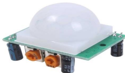
Figure 2. FOR Sensors

The PIR sensor or also known as Passive Infra Red is a sensor used to detect the presence of infrared rays from an object shown in Figure 2. As the name implies, the PIR sensor is passive, which means that this sensor does not emit infrared light but can only receive infrared light. infrared radiation from outside. The PIR sensor can detect radiation from various objects and because all objects emit radiation energy, for example when a motion is detected from an infrared source with a certain temperature, namely humans trying to pass through another infrared source such as a wall, the sensor will compare the received infrared emission. every unit of time, so that if there is movement there will be a change in the readings on the sensor [10].