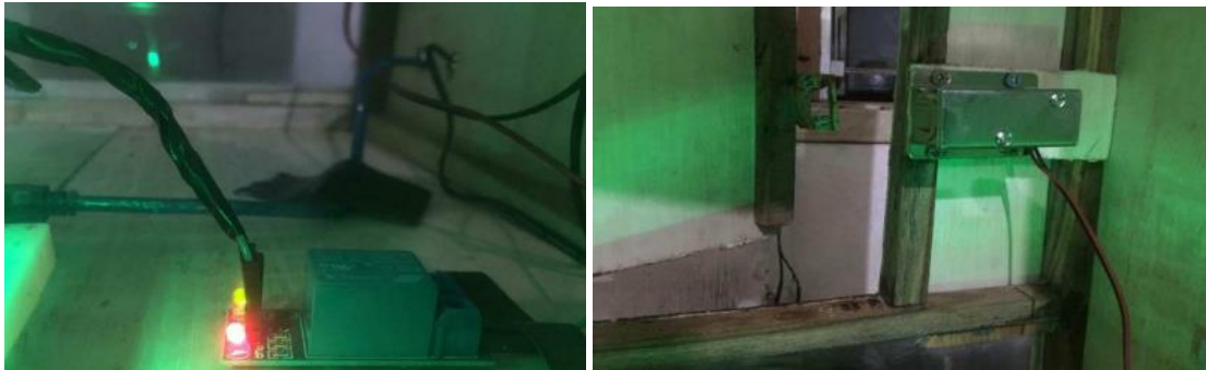
Figure 5. Solenoid doorlock display

Testing the doorlock solenoid connected to the 5 v relay serves to lock the charity box. This door lock Selenoid requires a supply voltage obtained from the adapter of 12v, the working system of this door lock solenoid is NC (Normally Close). The solenoid valve will be pulled if there is a voltage and vice versa the solenoid valve will be stretched if there is no voltage. The test can be seen in Figure 5.