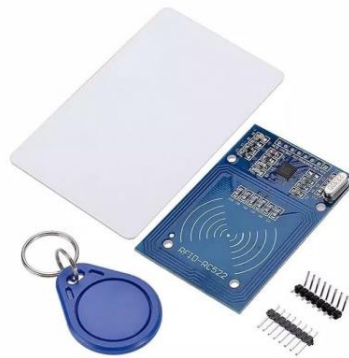
Figure 1. RFID

Radio Frequency Identification (RFID) is an identification method using a means called an RFID label or transponder to store and retrieve data remotely. An RFID tag or card is an object that can be attached or inserted into a product, animal or even human for the purpose of identification using radio waves. An RFID label contains information that is stored electronically and can be read up to several meters away. RFID reader systems do not require direct contact like barcode reader systems [9]. The appearance of RFID can be seen in Figure 1.