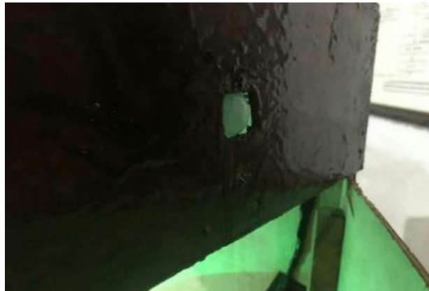
Figure 6. PIR sensor testing

In testing this PIR sensor using a 5v voltage from Arduino and tested with human hand movements for movement that passes in front of the PIR Sensor, the work of this sensor is to detect human movement if motion is detected it will turn on the buzzer as a sign of danger movement that will threaten security charity box in figure 6.