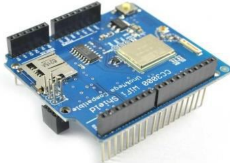
Figure 1. CC3000 Wifi Shield

CC3000 Wifi Shield is a standalone wireless network module that combines internet connectivity into a simple project. The CC3000 module uses an SPI interface that allows the user to control the data flow and perform data transfers at a fairly high speed [6]. The display of the CC3000 Wifi Shield can be seen in Figure 1.