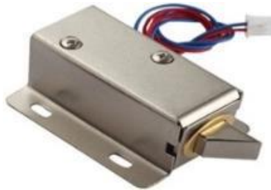
Figure 2. Solenoid Door Lock

The following is a display of the solenoid door lock as shown in Figure 2.