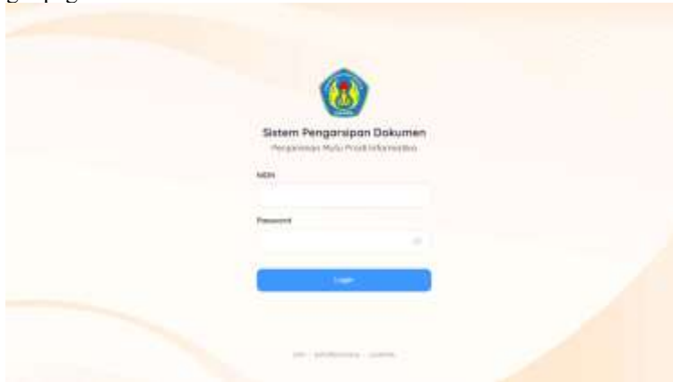
Fig. 4 Login Page Display

In this study the authors used the Laravel framework for system development and used the MySQL database. The following is how the login page looks for all user levels: