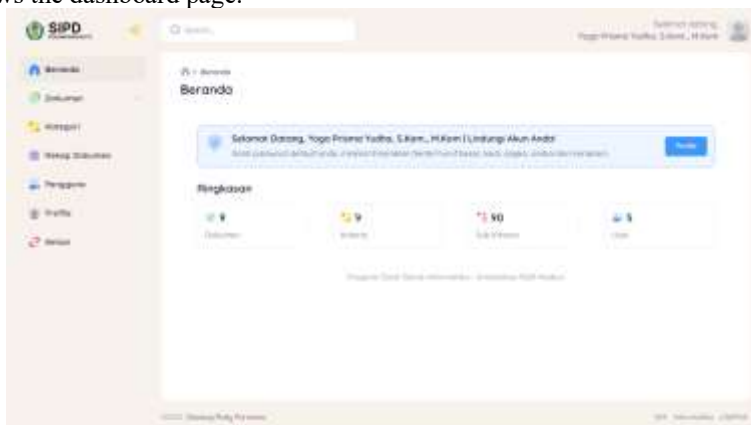
Fig. 5 Dashboard Page Display

The following is a recap of the quality assurance documents in pdf form, in which there are names of documents and links to supporting documents which can be in the form of files that are already in the form of links or related links.