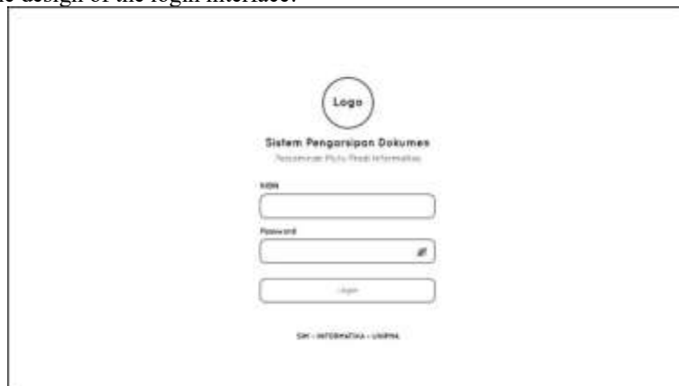
Fig. 2 Login Interface Design

The following is the design of the login interface: